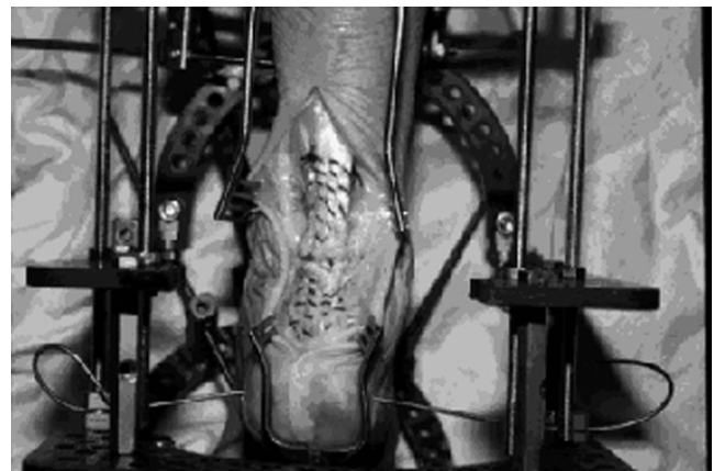
Fig. 2: A specimen repaired using the modified Krakow locking loop technique. Equal numbers of sutures were used above and below the repair with the knots tied proximal to the Achilles transection.

On average, the intact tendons ( n = 5 ) generated 10 N, 10.74 N, 15.8 N, and 31.9.0 N of force at 30, 20, 10, and 0 degrees ankle position, respectively. Following a modified Krakow locking loop repair the force across the repair site was 10 N, 11.46 N, 18.4 N, 30.3 N at 30, 20, 10, and 0 degrees ankle position (Table 1). A paired t-test was performed to test whether there were any statistically significant changes between the intact Achilles and each of the angles at 20, 10, and 0 degrees. None of the differences were statistically significant at p < 0.5 . Since our sample size was small we carried out a Wilcoxon signed-rank test at 20, 10, and 0 degrees, and the p -values were 0.50, 0.81, and 1.0, respectively.